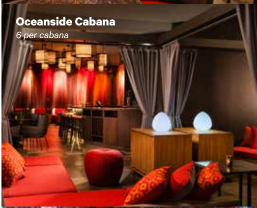
Oceanside Cabana 6 per cabana