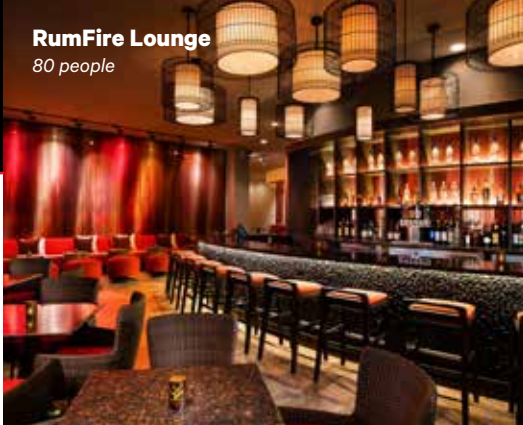
RumFire Lounge 80 people