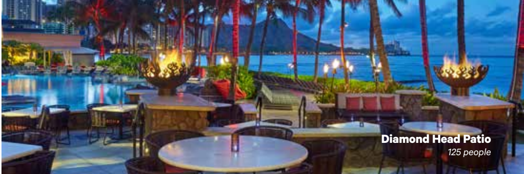
Diamond Head Patio 125 people