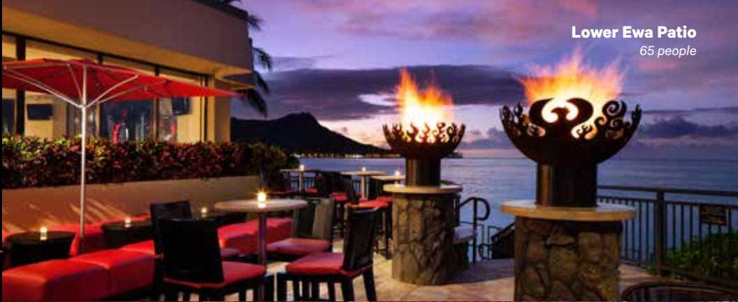
Lower Ewa Patio 65 people