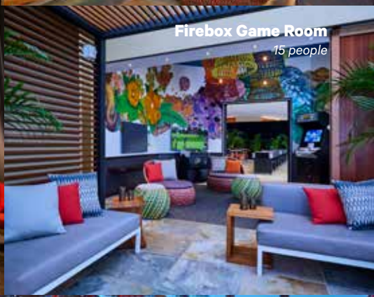
Firebox Game Room 15 people