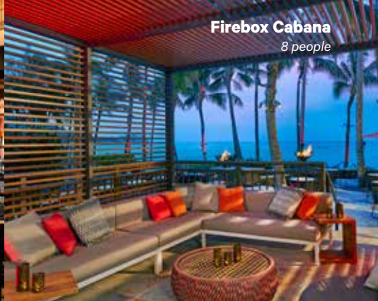
Firebox Cabana 8 people